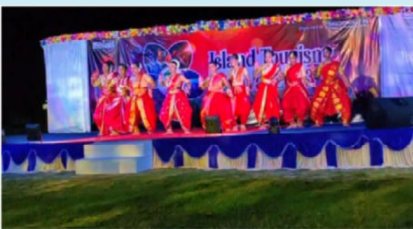
Dance performance by artistes enthrall gathering at Rangat