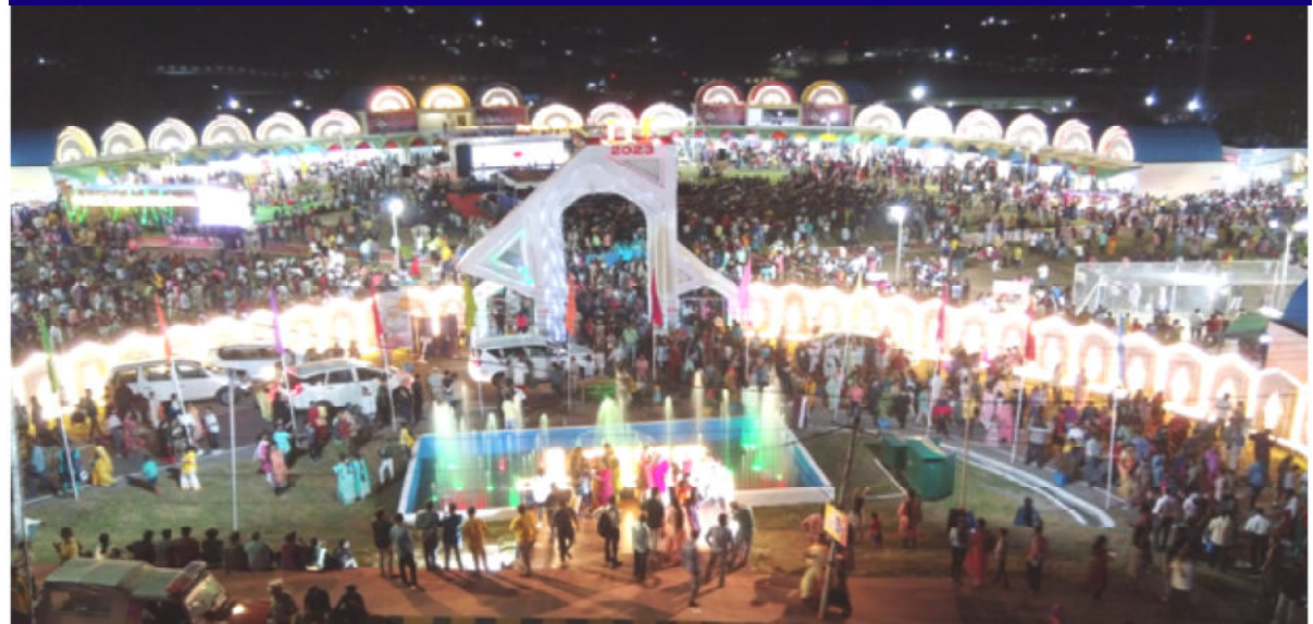
Glittery evening of the Island Tourism Festival being held at ITF Ground captured on drone

Staff Correspondent Port Blair, Dec. 29 The ITF Ground was buzzing with activities as the festive mood is gaining momentum, it being the 3 rd day of Island Tourism Festival. The air of merriment was seen at the venue, as people thronged the area to enjoy the cultural evening and stall hopping. The evening witnessed an electrifying performance by the Rock Band - End of Scene, who belted out some groovy numbers, making the entire festival come to live with people dancing to their beats. Their music made the young and old take the opportunity to jive and dance their heart out. The evening also witnessed intriguing Ghatam recitals by Padma Bhushan Vidwan TH Vinayakram (Vikku Vinayakram) who mesmerized the gathering with his astounding performance. Earlier, a Healthy Baby Show was organized by Health Department in the forenoon which saw enthusiastic participation from parents who brought their babies for the show. Apart from this, Musical presentation (Contd. on last page)