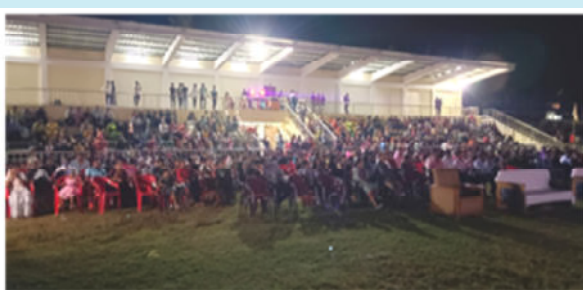
Large gathering enjoyed the cultural programmes organized as part of Island Tourism Festival at Diglipur

As part of Island Tourism Festival various programmes were held at different venues of A&N Islands. The programme was held at Diglipur, Rangat and other places in the Islands today.